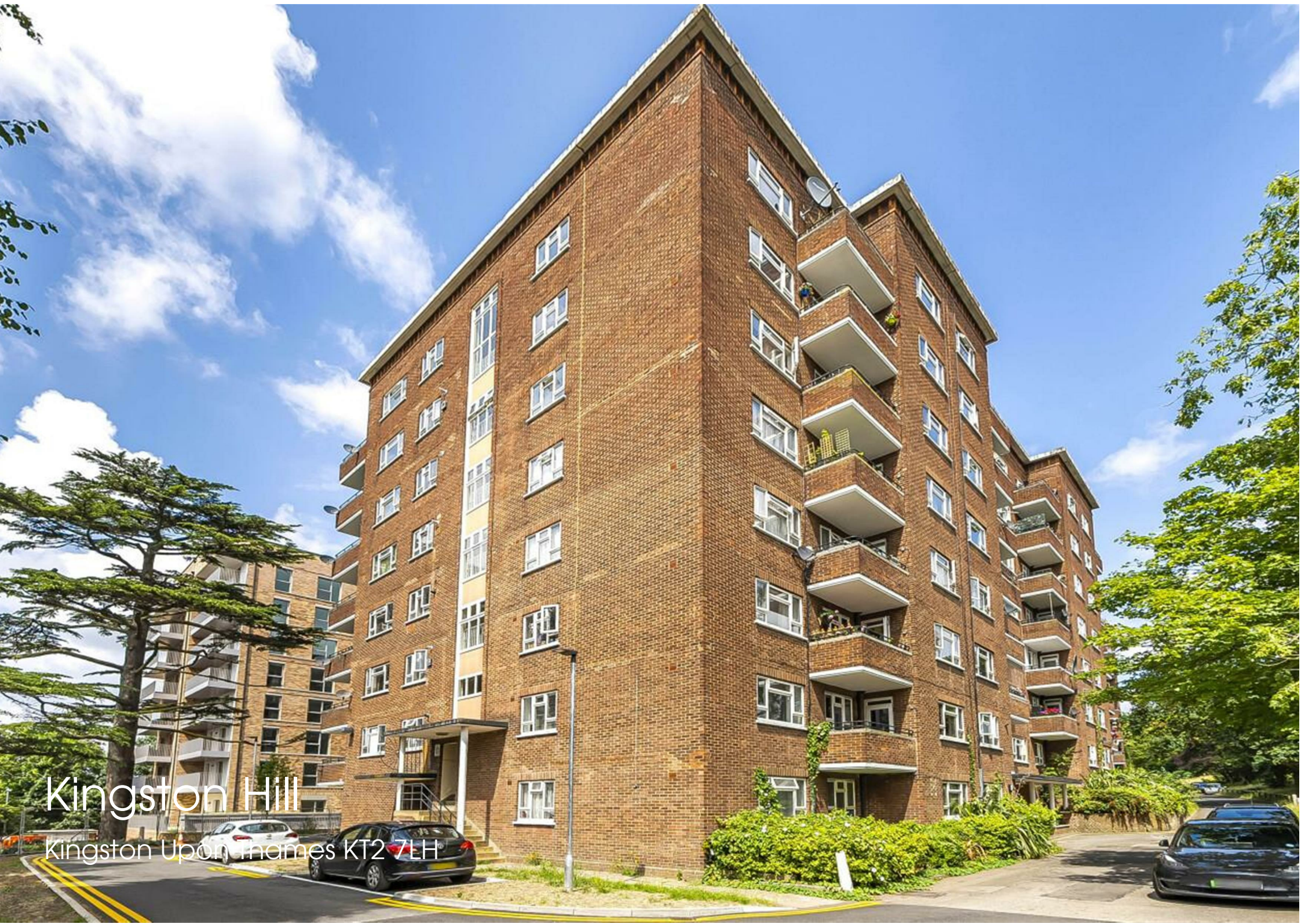
Kingston Hill Kingston Upon Thames KT2 7LH